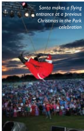
Santa makes a flying entrance at a previous Christmas in the Park celebration

There's plenty to cheer about for the team at HBS Bank this Christmas and we intend to be among the expected 25,000 locals doing just that after becoming the principal naming sponsor of HBS Bank Christmas in the Park this year.