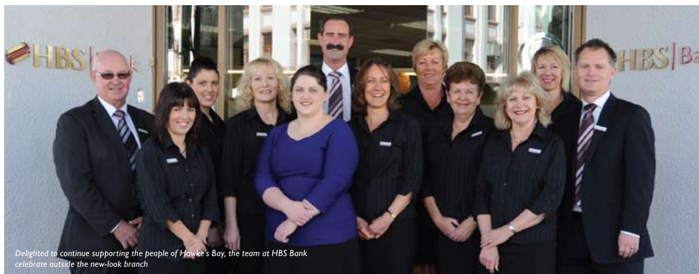
Delighted to continue supporting the people of Hawke's Bay, the team at HBS Bank celebrate outside the new-look branch

31 August will go down in HBS history as the day that 98% of voting HBS members agreed two proud New Zealand building societies should join forces.